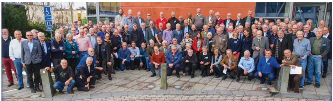
Figure 4. The Mölndal conference participants.References

On the return trip to Oslo next day, the 40 Norwegian participants visited Båhus Castle, the Shell Bank Museum in Uddevalla, a Wind-power company in Rabbaldshede, the World Heritage Rock Carvings in Tanum and the Solberg tower in Skjeberg where the land rising after the last Ice age is well documented.